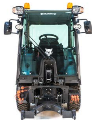
CX 55 SPECIFICATION

One Machine - One Operator - Endless Applications