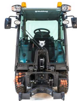
CX 55 L / CX 75 SPECIFICATION